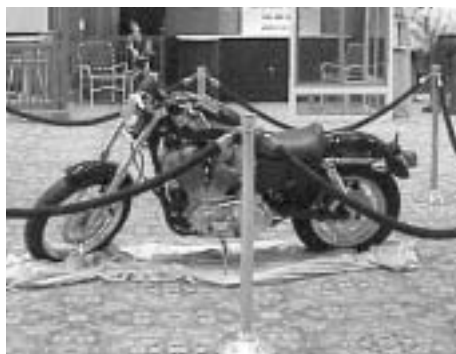
ASI Building Products will sponsor this year's dream raffle prize: a 2005 Harley Davidson Motorcycle.

Custom Window will sponsor the official Trade Show Program and contribute prizes to be raffled off throughout the show, leading up to the grand prize: a "Capture The Memories" package featuring a DVD Camcorder with a Kodak Digital Camera Bundle and DVD Recorder. A book of six (6) raffle tickets may be purchased for $10.