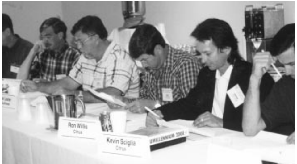
Board members review plans for 2000 during the Ft. Myers meeting.

The final State Board of Directors Meeting for 1999 was held Saturday, November 13, at the Holiday Inn SunSpree Resort in Ft. Myers. Over 25 members and guests were in attendance. The Board heard reports from the following committees. Below, please find a summary of the important issues and decisions of general interest.